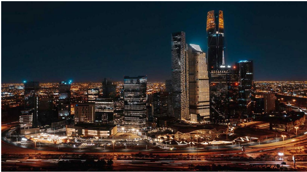
Creating the conditions for long-term, global investment

and professional services who take a more considered and longer view of the Saudi market. This is very positive.