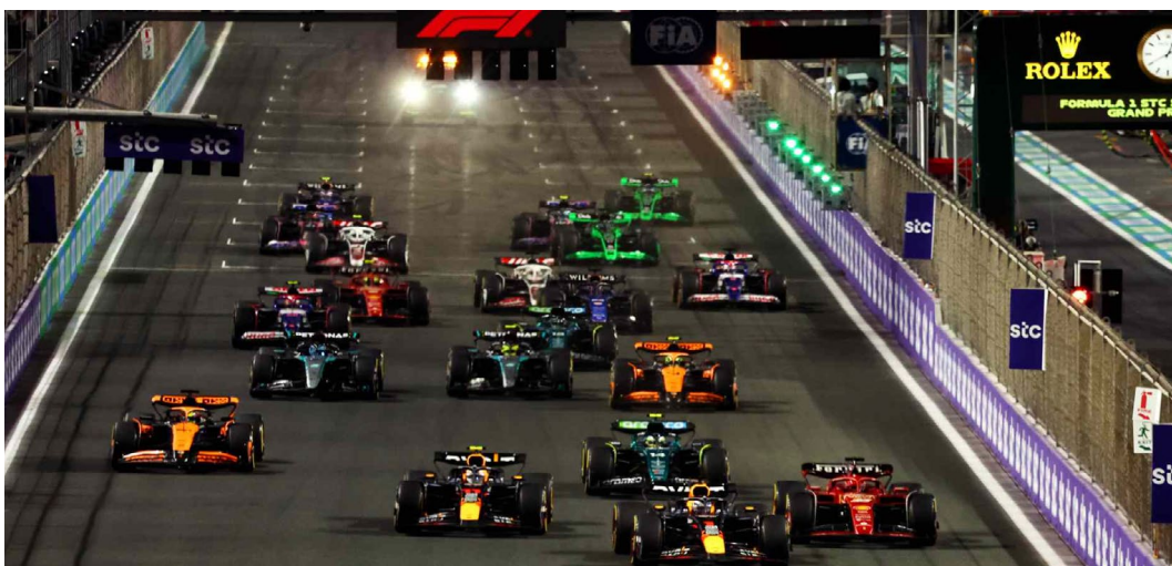
Global events supporting long-term economic growth

For foreign companies, this trend reinforces the growing importance of Saudi Arabia's non-oil economy as a source of opportunity. Sectors linked to consumer spending, business services, logistics, industrial production, digital technologies, and infrastructure continue to benefit from government support and Vision 2030 investment priorities.