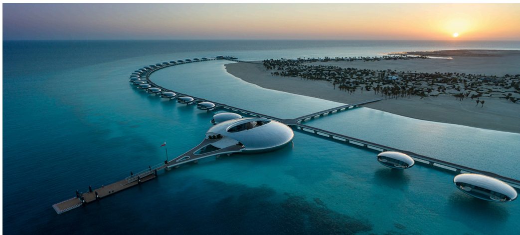
Where vision is already a lived experience - Red Sea Global, Saudi Arabia

We look forward to discussing these opportunities with our clients.